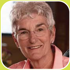
KATHY GRAZIANO Richmond City Council President

900 E. Broad Street, Suite 202 Richmond, VA 23219